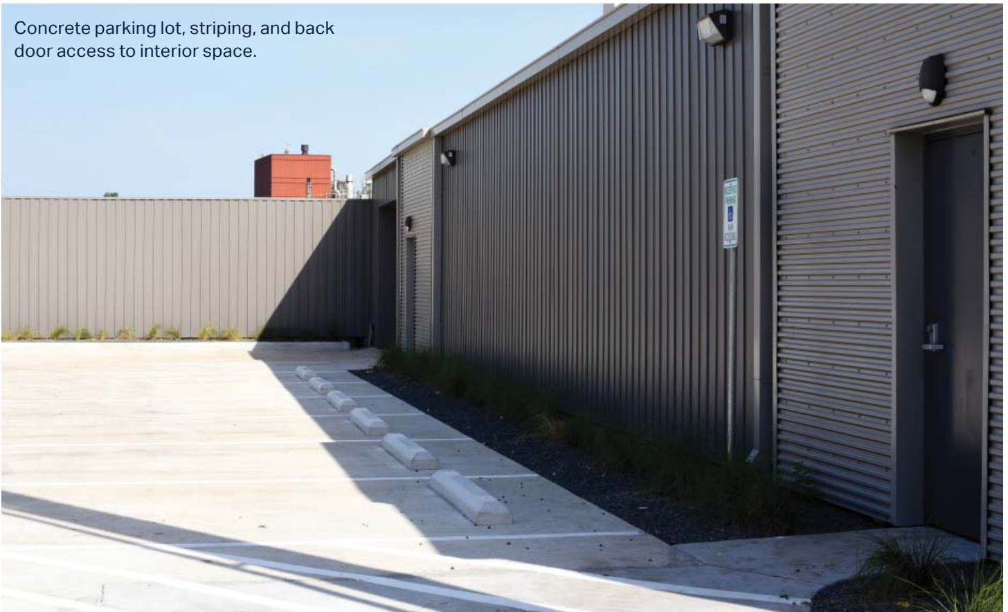
Concrete parking lot, striping, and back door access to interior space.