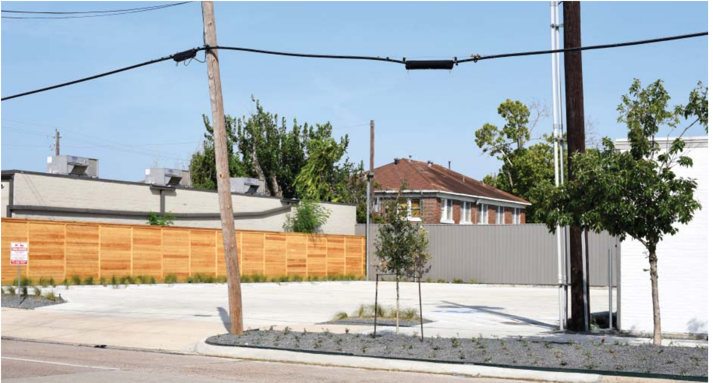
Newly completed parking lot, landscaping, and perimeter fence.