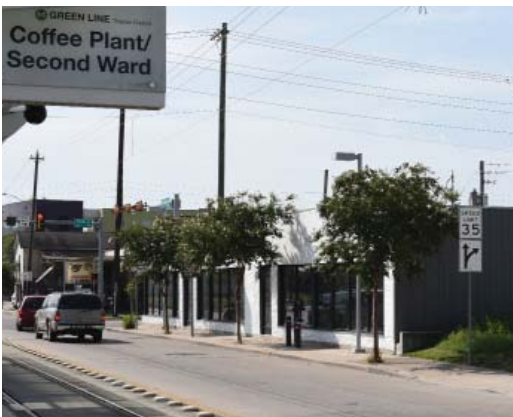
EXTERIOR VIEW | View along Harrisburg Blvd